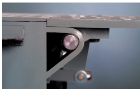
Two-point crown control