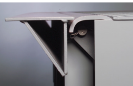
Constant radius rear hinge

*Shown with optional Rite-Hite® VHLS Under-leveler Seal.