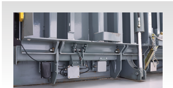
Safe-T-Pit™ (patent pending)